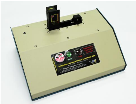
Integrated Checkout Station Model Number: HN-ICS

Just drop the PAD in the holder and in less than 10 seconds the COS will verify that the PAD is working properly.