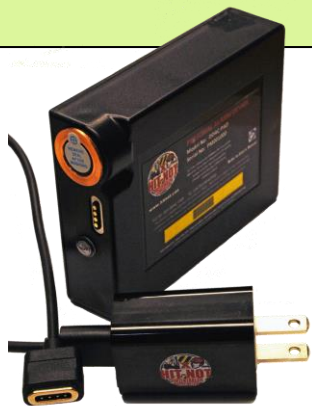
Personal Alarm Device with new Magnetic Charge Port and Charger Cable

One will be included at no additional cost, and replacements can be sourced at a host of local outlets. A 10-position charge unit will be available at a low cost.