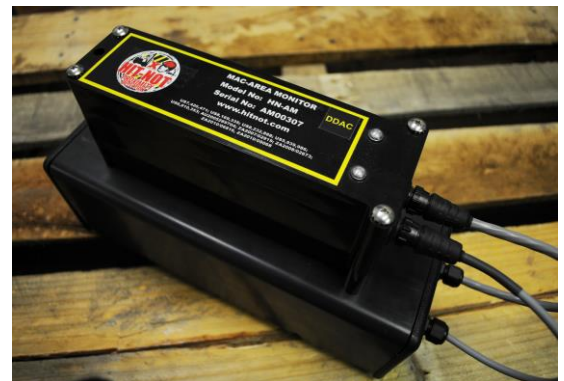
DC Area Monitor Model Number: HN-AM-DC

And it is simple to install and plugs in with an included power supply.